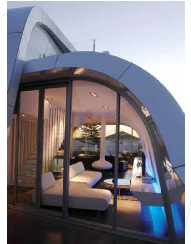
Left: A wedge-shaped window frames a slice of nature from the open-concept first floor, where most family life occurs. As night falls ( above ), soft lights reflecting off white surfaces—a leather sofa and chaise, a long deep shelf, and a floating fireplace—turn the family room, on the same level, into an inviting, ambient pod.

'THERE'S A CERTAIN NOSTALGIA ABOUT A JAMES BOND LOOK NOW,' OWEN SAYS. 'IT'S HISTORICAL MODERN.'