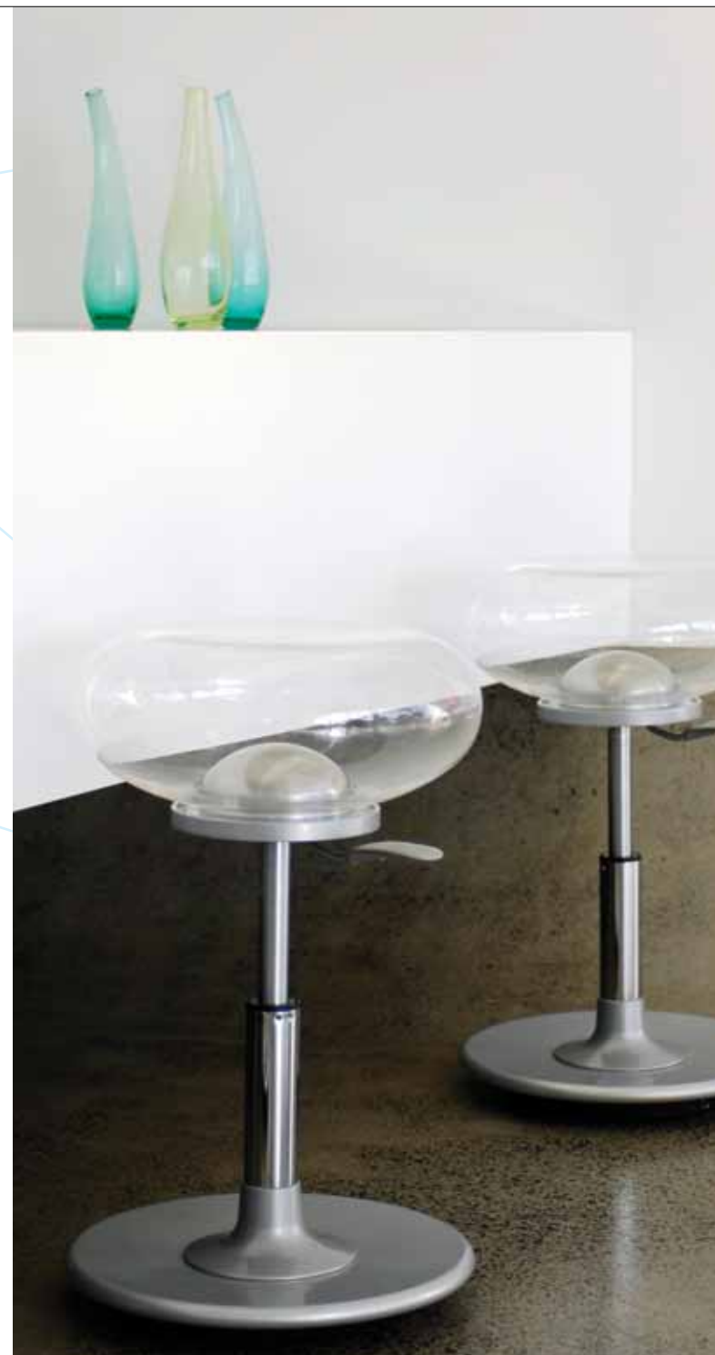
The kitchen's pairing of seamless white and black surfaces might be the ultimate in functionality, yet the visual result is pure luxe. The island counter is a slab of Corian (the same as that used for the stair steps) that angles elegantly to the floor. "We like to do something sculptural in kitchens," Owen comments. The pillowy look of acrylic bubble stools complements the floating effect of the island.

Ultimately, of course, software modelling is just another architect's tool, a means to an end. The other challenge in building the house came in the construction process, which Owen compares to the fabrication and assembly of a car. The steel frame is clad in metal panels, which were precut in China. The cladding fits tightly over the steel-rib structure of the house; any deviance by even a few millimetres would have distorted the shape and ruined its clean lines. The steel structure, which Owen casually refers to as the chassis, took