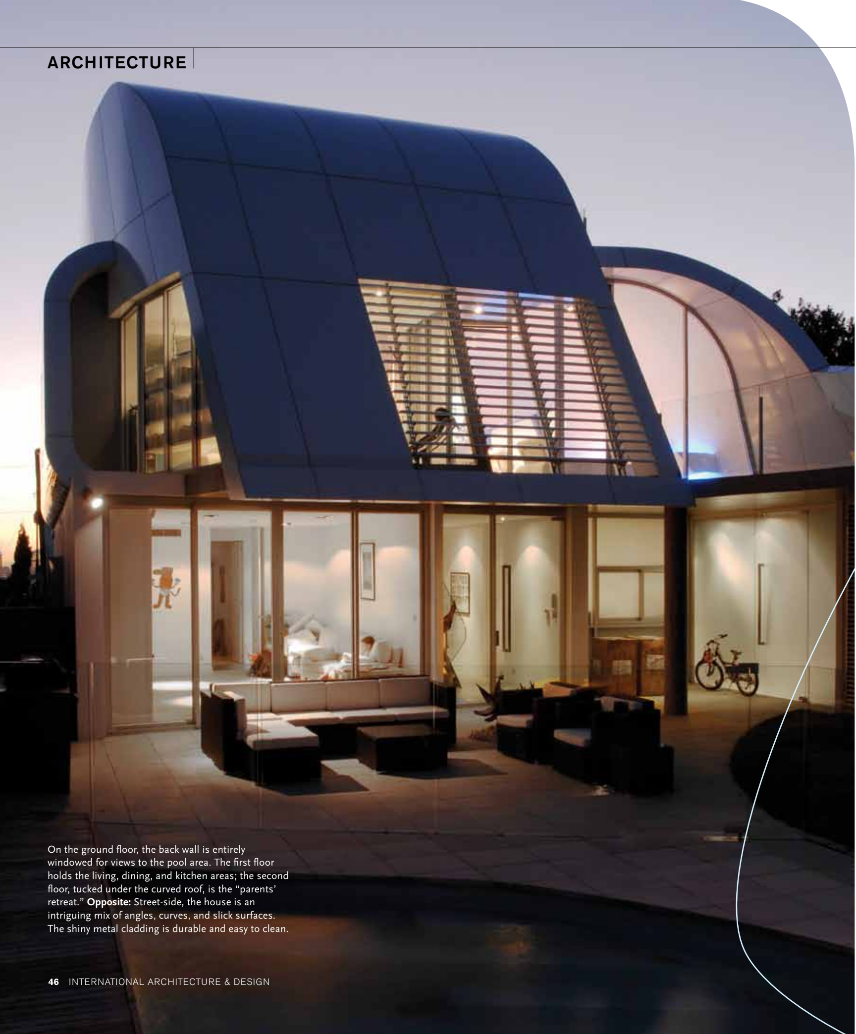
On the ground floor, the back wall is entirely windowed for views to the pool area. The first floor holds the living, dining, and kitchen areas; the second floor, tucked under the curved roof, is the “parents’ retreat.” Opposite: Street-side, the house is an intriguing mix of angles, curves, and slick surfaces. The shiny metal cladding is durable and easy to clean.